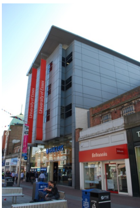
University of Essex, Elmer Approach (Elmer Square Policy Area)