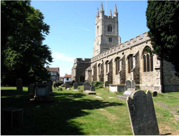
St Mary's Church, Victoria Avenue (outside of the SCAAP boundary)