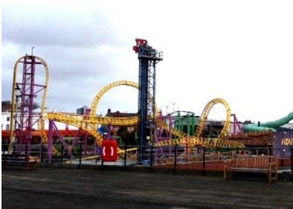
Adventure Island, Western Esplanade (Central Seafront Policy Area)