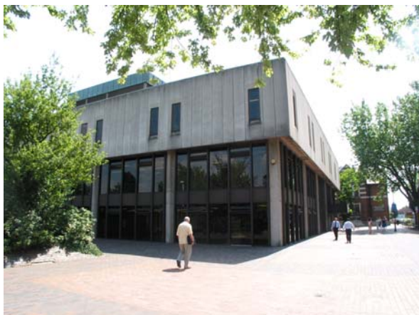
Central Library (former), Victoria Avenue (Victoria Gateway Neighbourhood Policy Area)