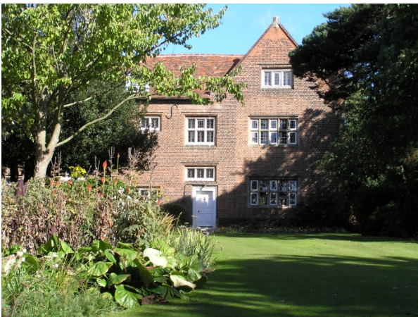
Porters, Southchurch Road (outside of the SCAAP boundary)