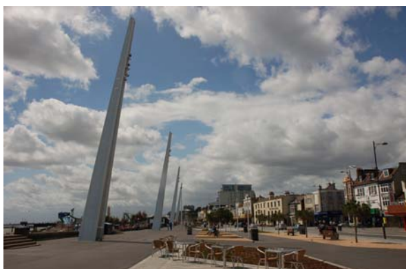
Seafront / Estuary (Central Seafront Policy Area)