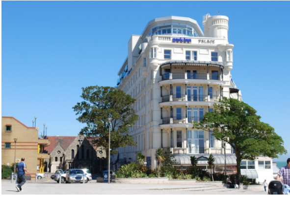
Park Inn Palace Hotel, Pier Hill (Central Seafront Policy Area)