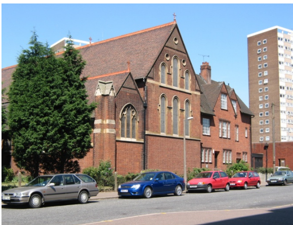
All Saints Church, Sutton Road (outside of the SCAAP boundary)