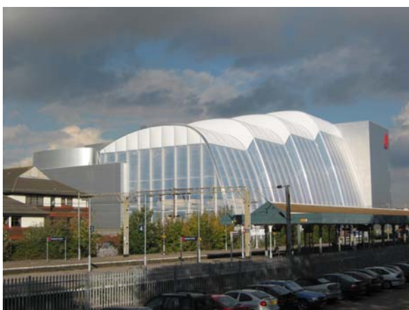
South Essex College, Luker Road (Elmer Square Policy Area)