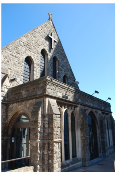
St John's Church, Herbert Grove (Central Seafront Policy Area)