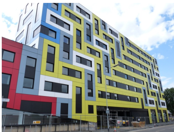
University of Essex, Elmer Approach (Elmer Square Policy Area)