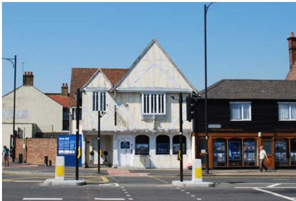
Swan Hall, Victoria Avenue (Victoria Gateway Neighbourhood Policy Area)