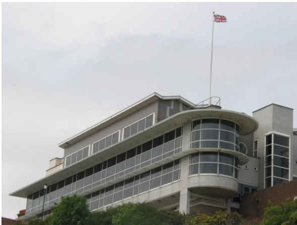
Cliffs Pavilion, Station Road (Central Seafront Policy Area)