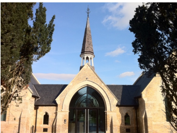
Prittlewell Chapel, North Road (Victoria Gateway Neighbourhood Policy Area)