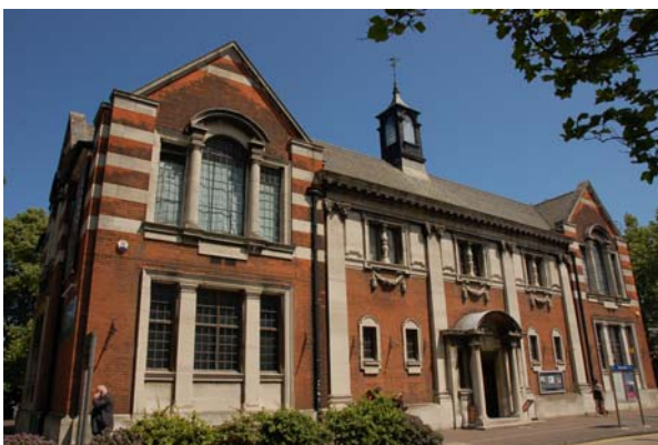
Central Museum, Victoria Avenue (Victoria Gateway Neighbourhood Policy Area)