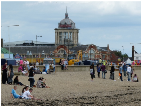
The Kursaal, Eastern Esplanade (Central Seafront Policy Area)