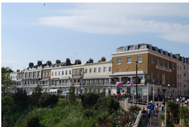
Royal Hotel and Royal Terrace (High Street and Clifftown Policy Areas)