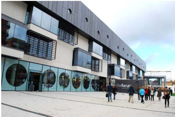
The Forum, Elmer Square (Elmer Square Policy Area)