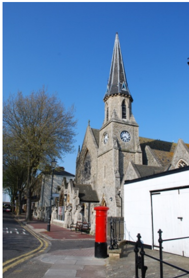
Clifftown Church/Studios, Nelson Street (Clifftown Policy Area)