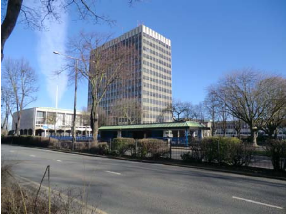
Civic Centre, Victoria Avenue (Victoria Gateway Neighbourhood Policy Area)