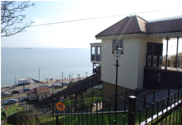
Cliff Lift, Western Esplanade (Central Seafront Policy Area)