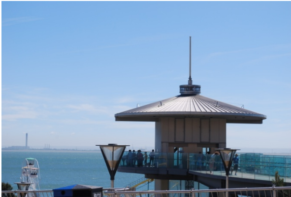
Pier Hill Observation Tower and Lift, Pier Hill (Central Seafront Policy Area)